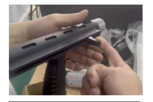
2. Pull the ejector rod towards you.