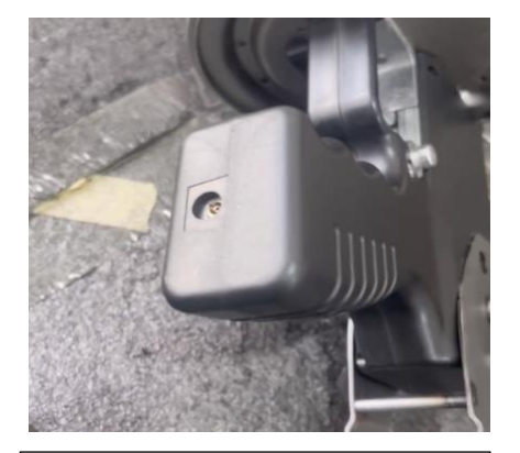
1. Fill the gun from the underneath of the pistol grip with Green Gas or 134a

Capacity: 12 cartridge shells Velocity: 260 FPS (Green Gas @ 5 bbs) 230 FPS (Green Gas @ 7 bbs) 330 FPS (134a @ 1 bb) 200 FPS (134a @ 3 bbs) 150 FPS (134a @ 7 bbs)