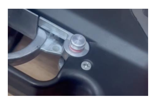
10. Red band marking indicate that you are ready to fire

9. Press down the safety button (Safety Off)